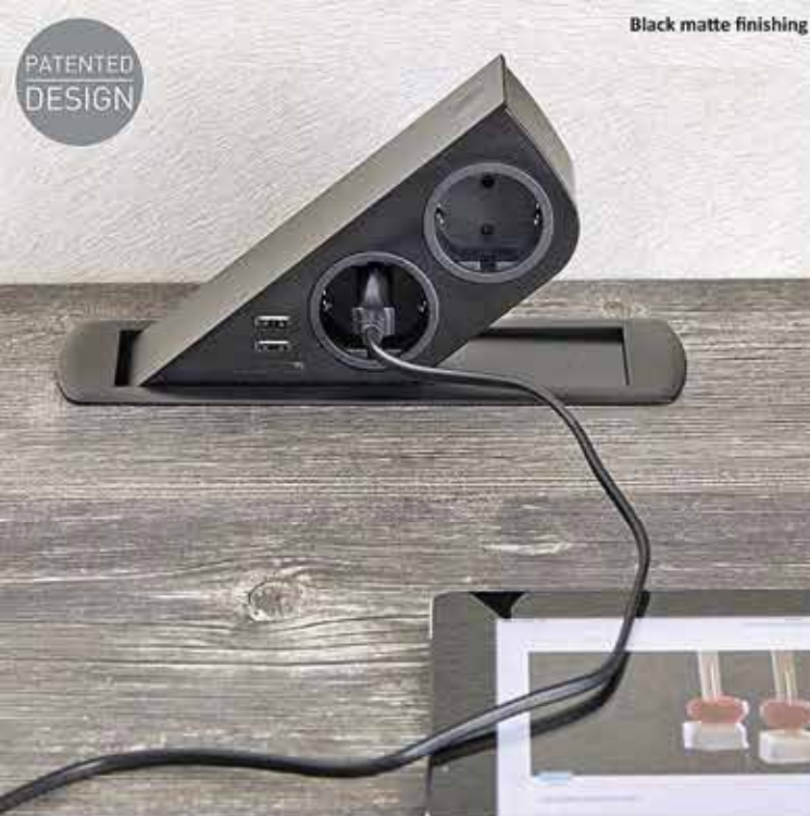
Black matte finishing